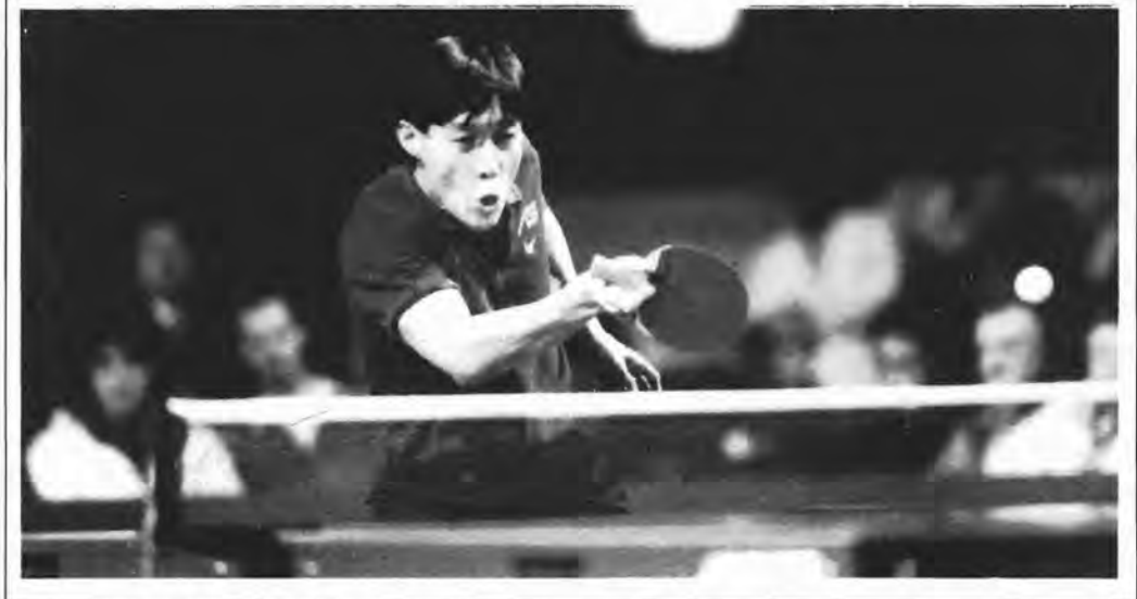
China's star of the tour Xie Chaojin