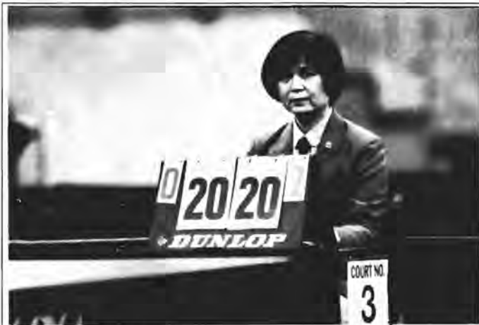
Japanese umpire Yukiko Hiraike