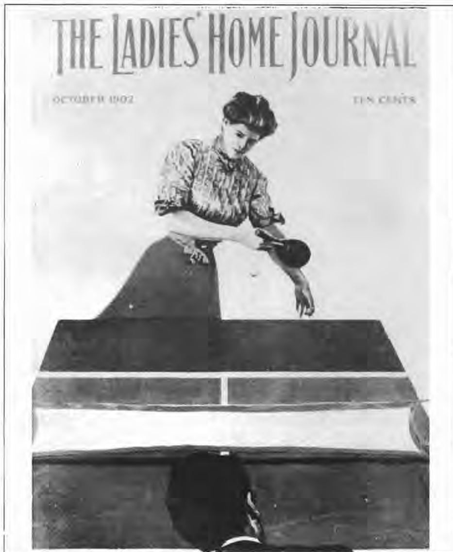
Magazine cover showing an unusual end-on view of players in action, U.S.A., 1902.

The game - under whatever title - seems to have taken off in the United